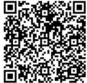
QR Code to the Oroville Public Library Website